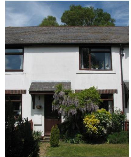
Before, May 2009